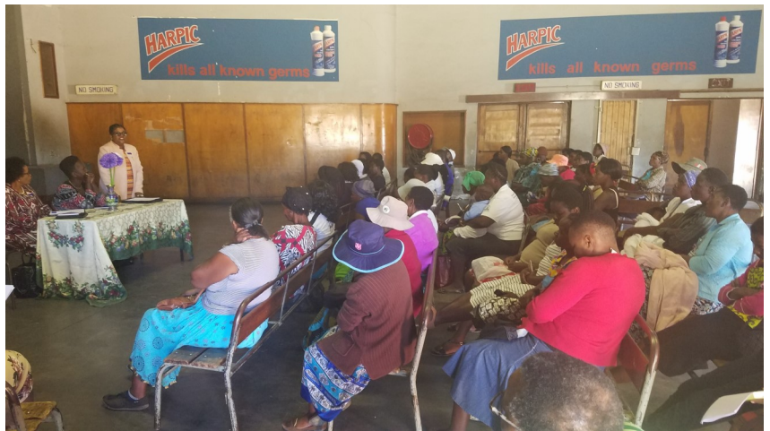
From the Assessment in a very poor community in the suburbs of Harare Zimbabwe.