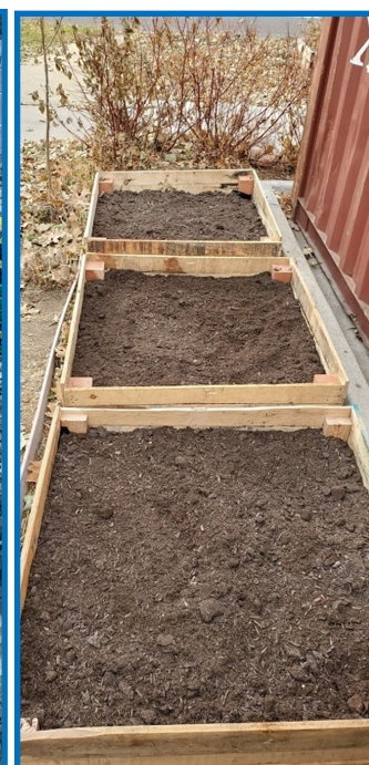
Tom Cella at Metro Caring building raised flower beds with donated lumber and bedding soils.