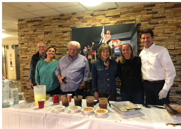
Volunteers at Craig Hospital last week