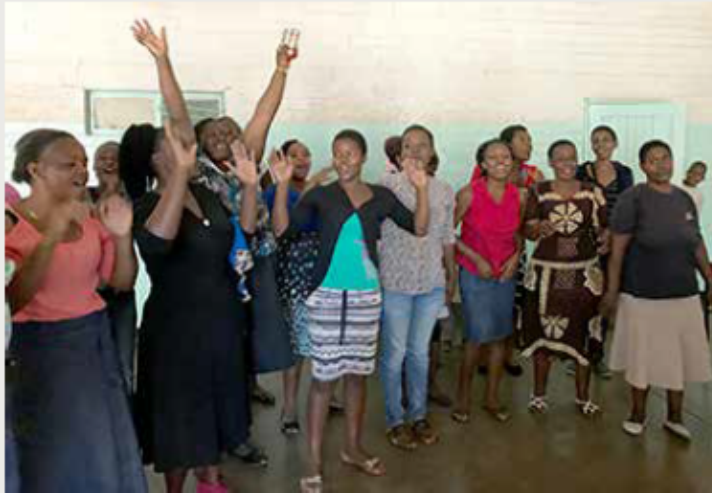
Graduation celebration as Graduates sing "Rotary Lifts Us Up"

of the future. They highlighted the importance of the group dynamic, the power of WhatsApp (the inexpensive social media that they use for marketing), and the advantage of keeping proper books for their businesses. They referred to their feeling of empowerment when they realized that they could save, even in a difficult financial environment. Their future plans are grounded in what