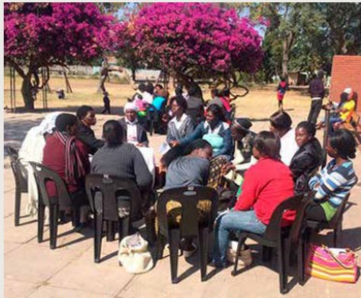
Women's Self Help Groups economic training outdoors