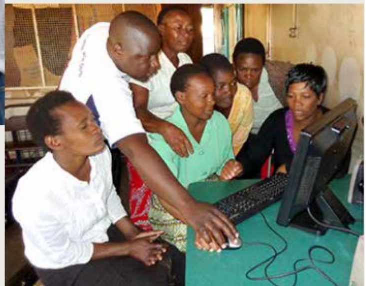
Women Eagerly learning how to make computers work for them