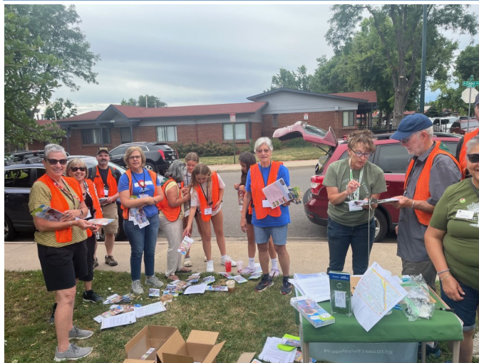
DMH Rotarians packing food at Village Exchange Ctr —> 1st and 2nd Wednesdays of each month.

<— DMH Rotarians distributing doorhangers in the Valverde neighborhood for The Park People's low cost tree program.