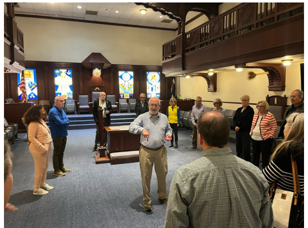
Rotary provides opportunities that we otherwise might not have, such as our recent trip to the Welton Masonic Temple.

Completed SOS housing SOS - Safe Outdoor Space