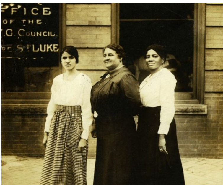
Pictured in the middle: Maggie Walker, pioneer of the first bank chartered by a Black woman, the illustrious St. Luke Penny Savings Bank.

Their unwavering determination and indomitable spirit continue to inspire us today. Let's honor their lasting impact and commit to continuing their mission of empowering others!