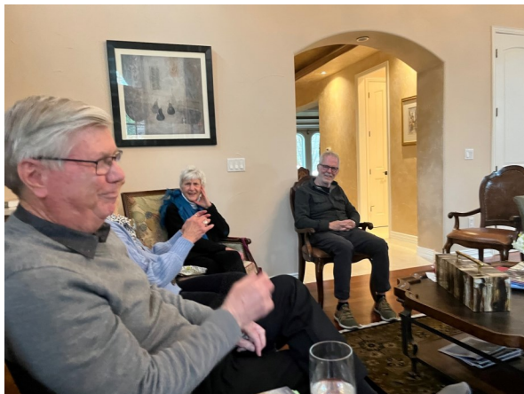
One of us...John F. Kennedy

May 29 - 5th Wednesday Happy Hour - location to be announced later. Usually 5-7pm