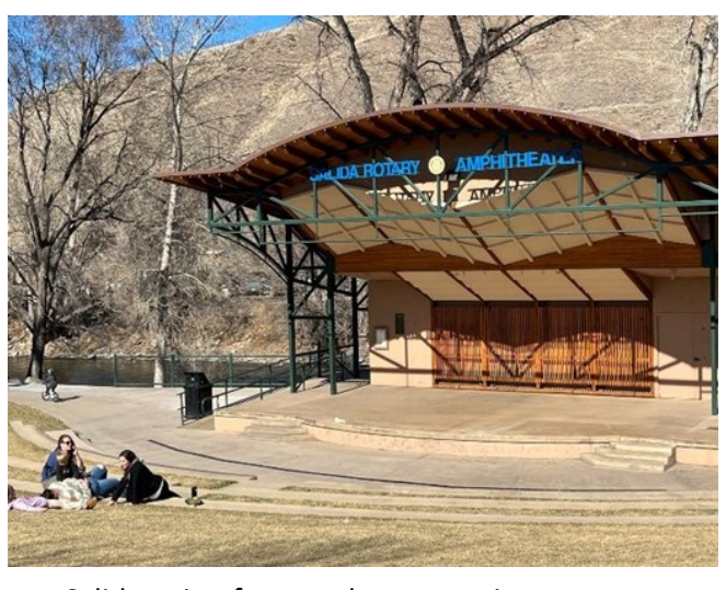
Salida – riverfront park, community stage