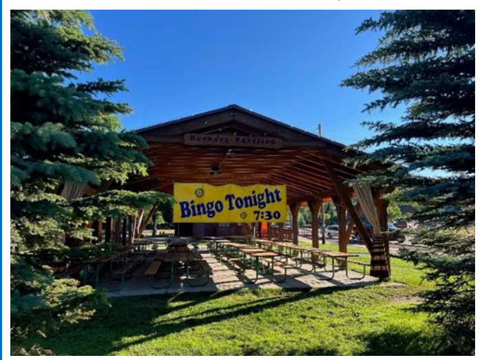
Aurora-General's park, urban park on Fitzsimmons campus