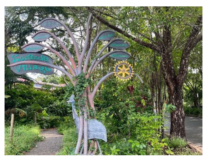
Kuranda Village, NE Australia – welcome sign