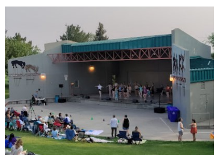
Steamboat-peace pavilion & Yampa River boardwalk Loveland-Hammond amphitheater adj to sculpture garden