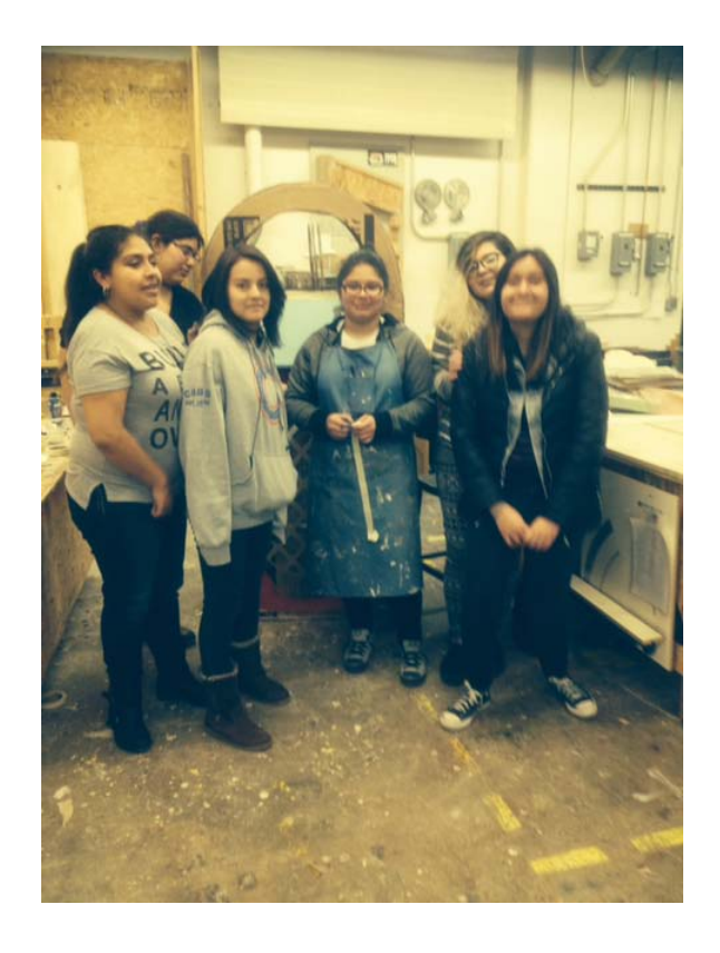
CEC Interactors Building Jukebox for Valentine's Dance