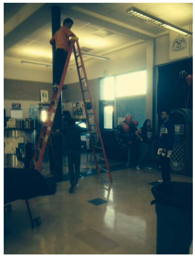
Decorating for Valentine's Dance set up