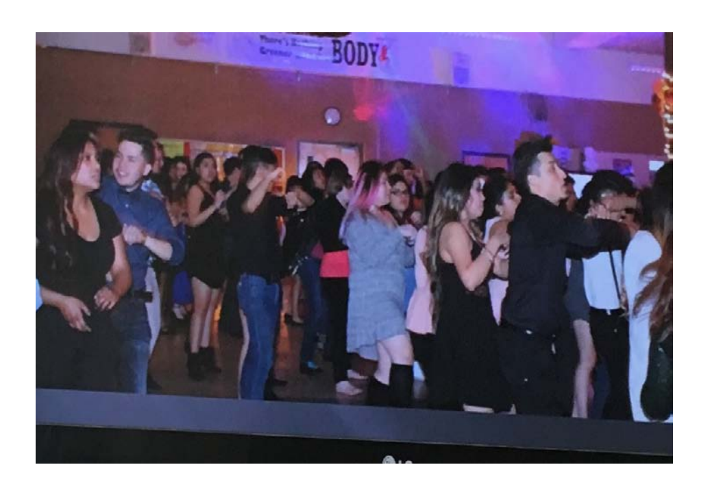
CEC Interact Club's Valentine's Dance Raises $600 for Thirst Project!