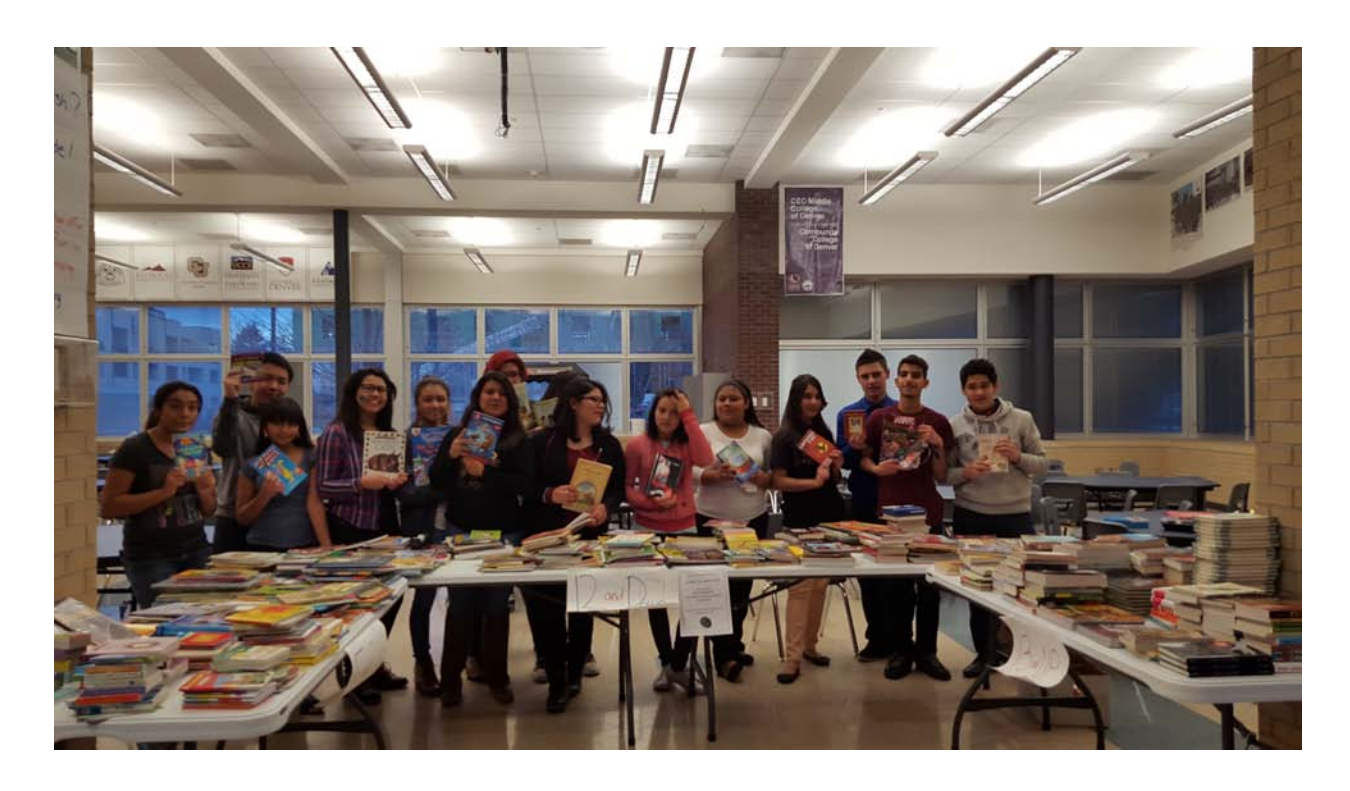
CEC Interactors Prepare Children's Books for Give Away to CEC Families

CEC Interactors obtained children's books from DMHR and distributed them to CEC families to give as Christmas presents. They researched where to distribute leftover books, and selected a Denver agency that serves families. (December)