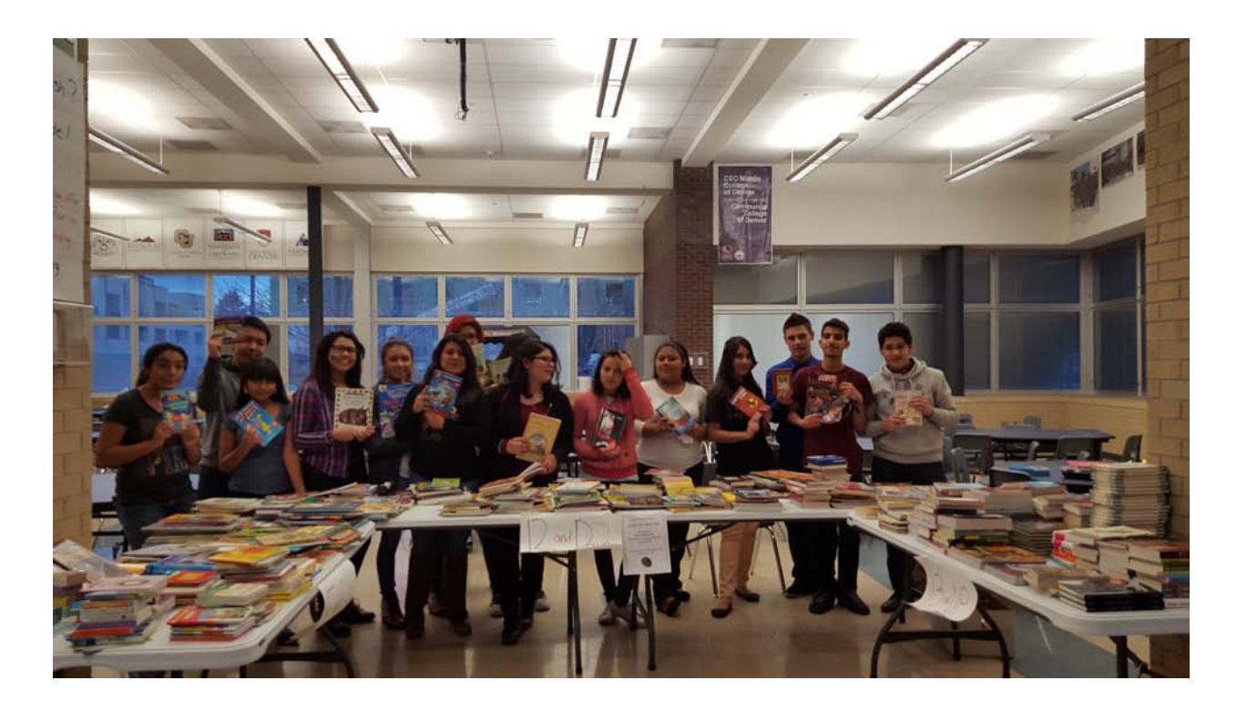
CEC Interactors Prepare Children's Books for Give Away to CEC Families

CEC Interactors obtained children's books from DMHR and distributed them to CEC families to give as Christmas presents. They researched where to distribute leftover books, and selected a Denver agency that serves families. (December)