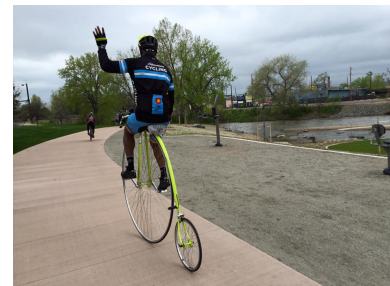
Rotary Bike Ride