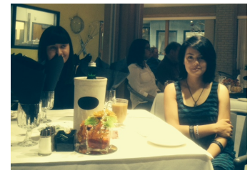
Fun photos from CEC Interact Breakfast.