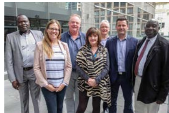
Members of the Sudd Foundation Board