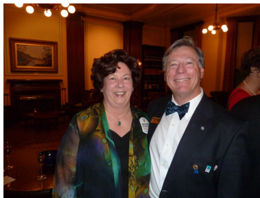
Pictured: The Organiser and the Organised