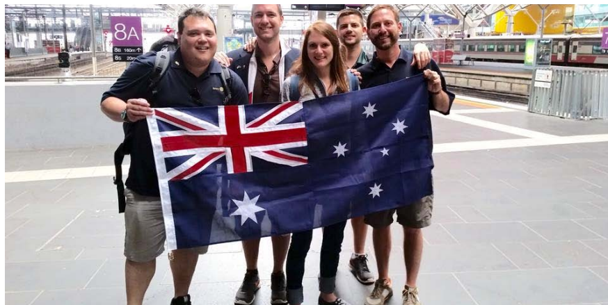
Next week our club will be hosting the Group Study Exchange visitors from District 6840, Louisiana USA.

The five visitors will be billeted by five of our members for six days, which include a range of several vocational visits for the inbound team and social time over the long weekend. The Vocational Committee members have each coordinated arranging the vocational visits with considerable assistance from other members' and their contacts in the city.