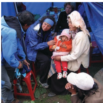
Photo. A Medical Centre in Tibet.

His program was among the recipients of aid from the $114,000 raised in total by the open-garden weekend Garden DesignFest last November.