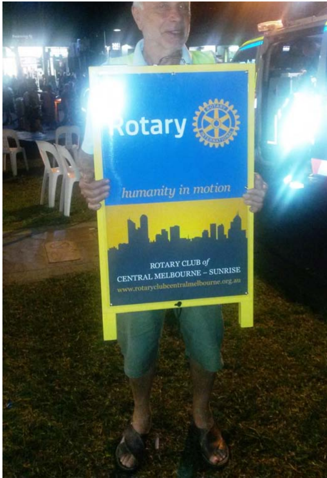
boards at the White Night event.