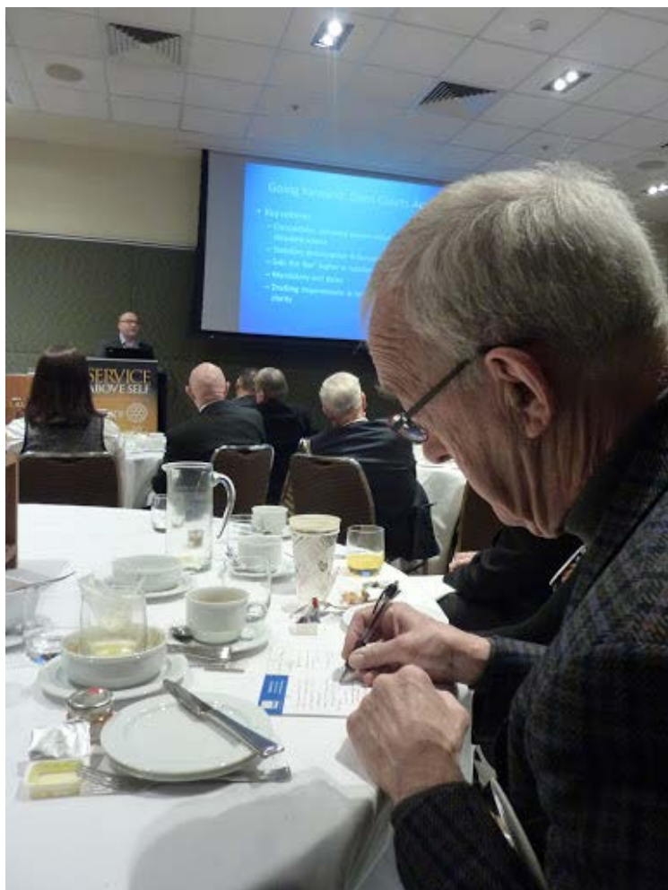
No let up for the Reporter.