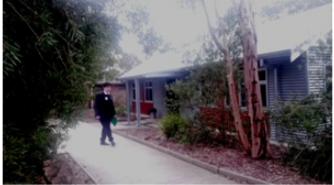
THE BOYS DORMITORY