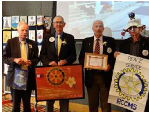
Picture left: the banner ex