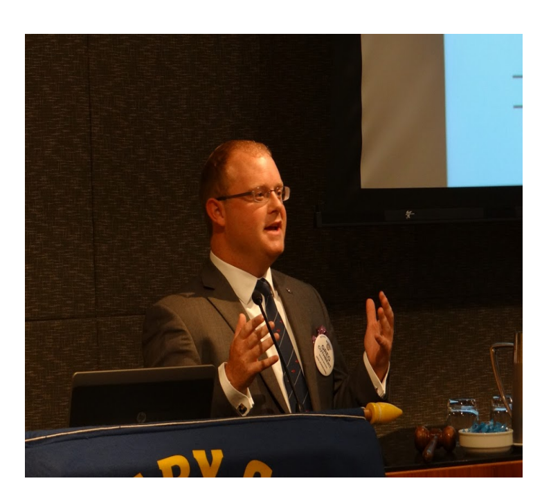
"Well foks what do you want to know about new media banking"