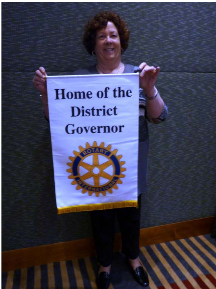
NEVER A TRUER WORD WRITTEN