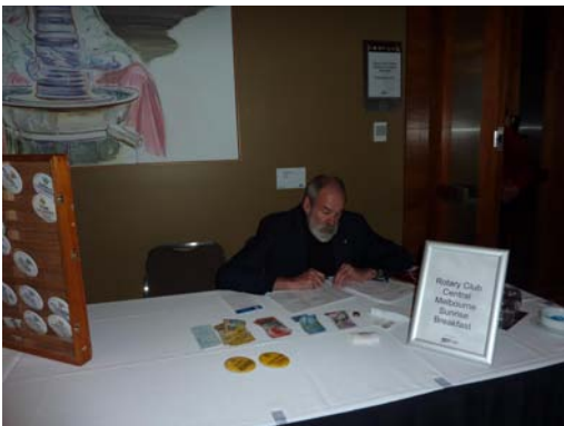
The loneliness of being an Assistant Treasurer.