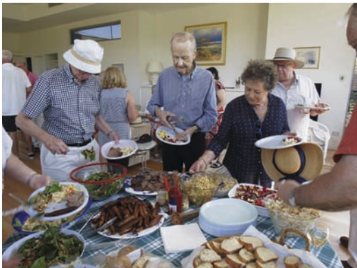
A lot of happy and well fed people!