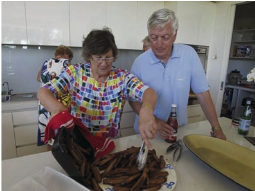
The customers [a discerning group]

The hosts [doing what they do best] The cooks [Guy Grossi does not compare-next gig MKR?]