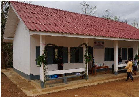
The new classrooms at Ban Boum Aor.