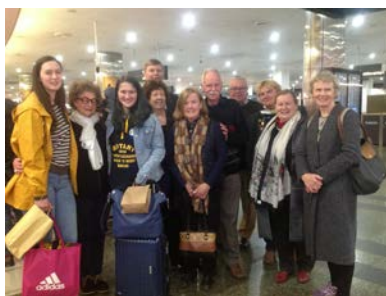
Final farewell team