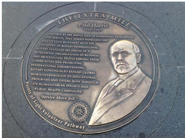
"a familiar face outside the White House"

Pauline and I are just about 'museumed' out but were lucky enough to gain tickets to the latest Museum, opened 10 days ago, called "African American Museum" which will be the "go to Museum" in years to come. Absolutely riveting as to the Negro(ex Africa) history."