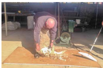
A Master class in shearing a sheep