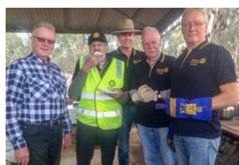
Our men taking a well earned break