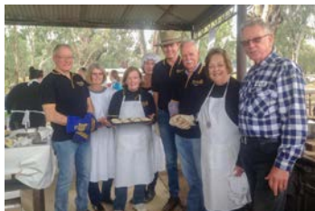
A good turnout from Rotary Central Melbourne