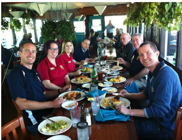
May 5th in Monterey, USA for lunch