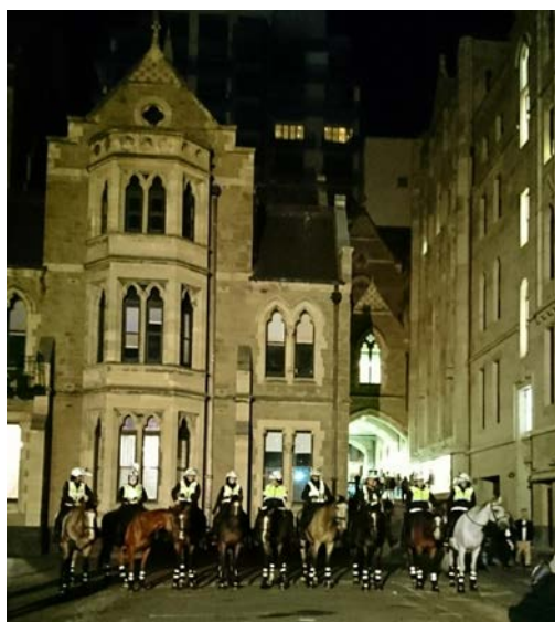
Stop horsing around - Mounted Police on standby next to Rotary Rest Centre at White Night