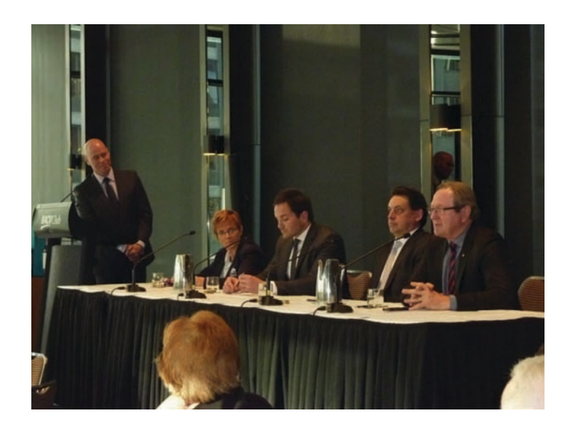
The Sports Panel in full flight and voice-no holding back!