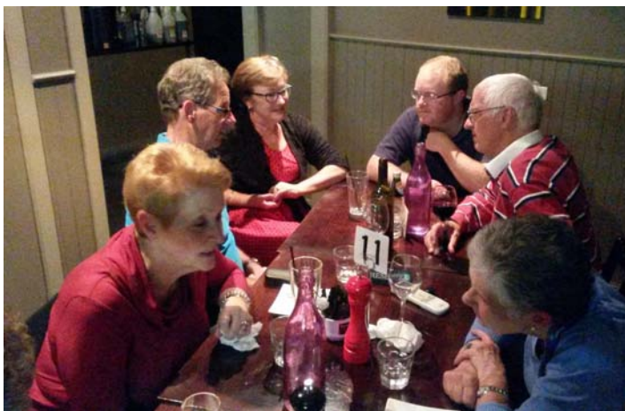
DINNER AT THE JUMPING JUMBUCK, EUROA

Editor. We hope you enjoy these people photos in the BULLETIN . For photos of the gardens please look at the club Picasa Web pages - "Event #7 2014/15" - although teams were busy for the whole day and few photos were taken of the garden displays!