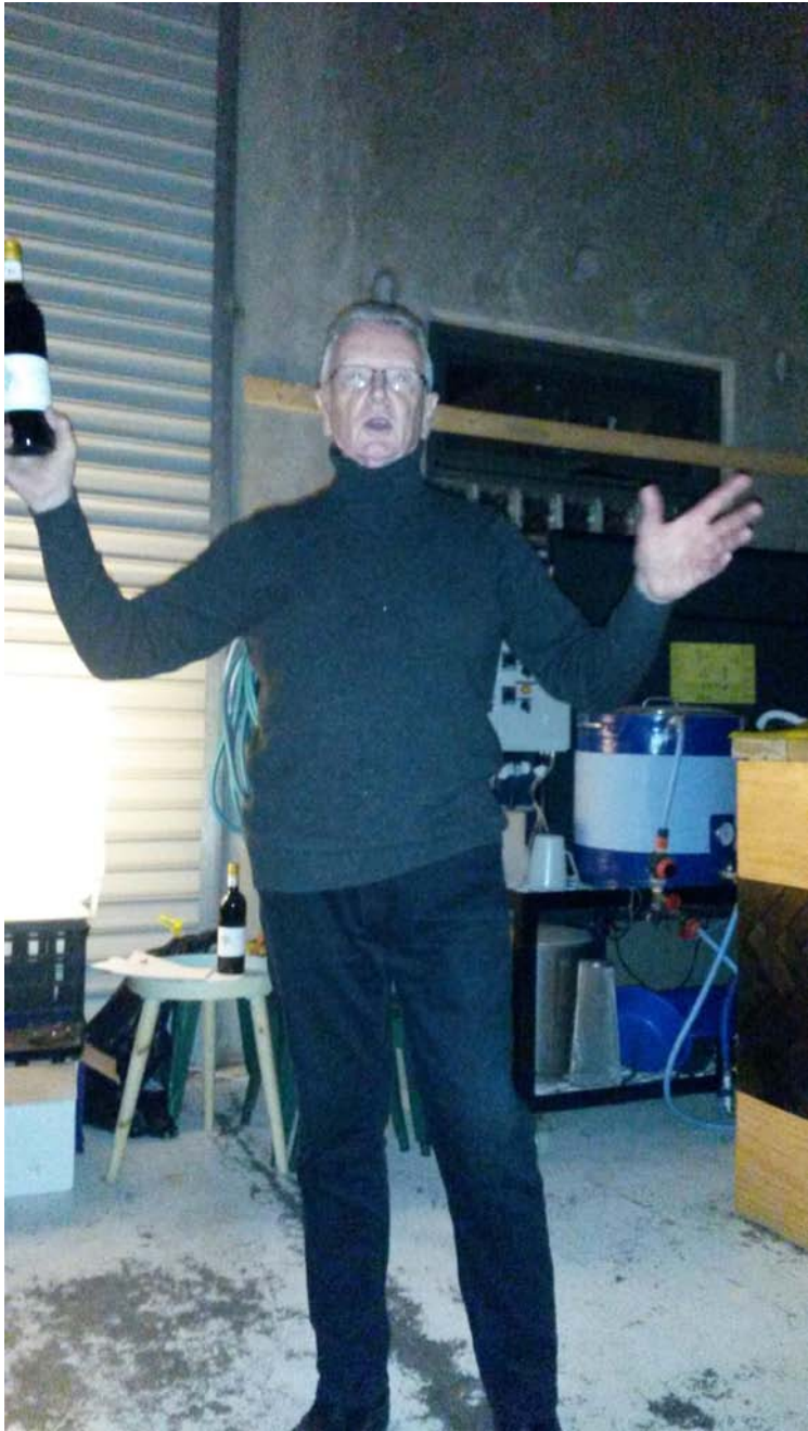
Some punters at the wine auction.