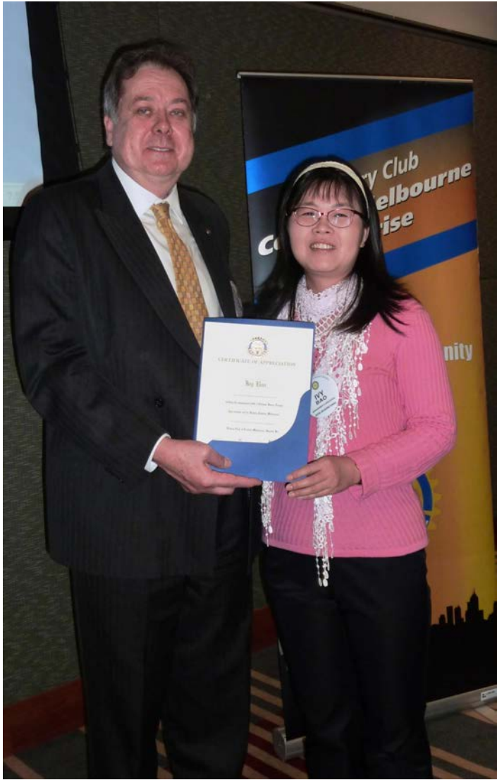
PP GEORGE PRESENTING IVY WITH CERTIFICATE OF APPRECIATION