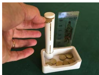
Centurion money box's are, available from Neville 2