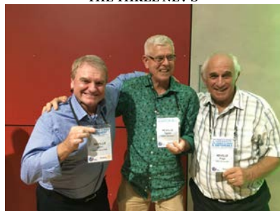
THE THREE NEV'S

THIS WEEKS CANDIDS, including Neville's painless way to become a Rotary Centurion - photo #6.