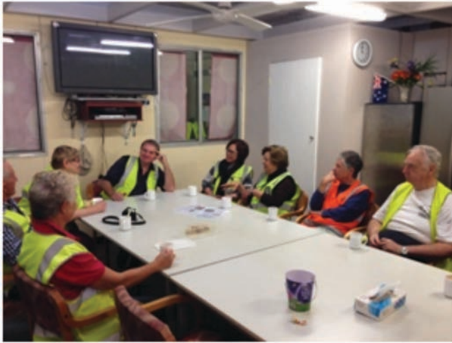
'DIK' WORKING BEE IN FULL SWING