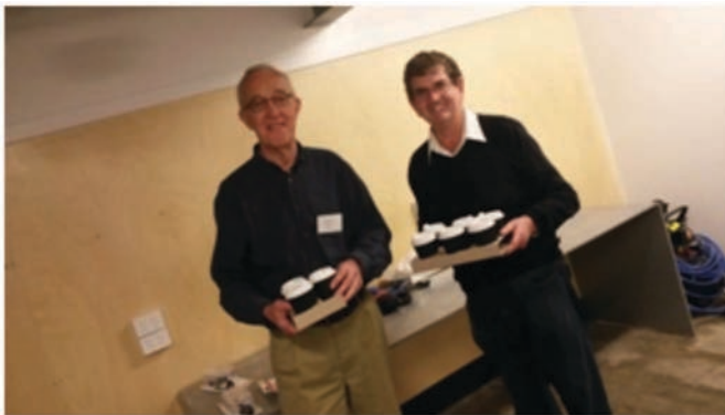
MENS SHED GUYS ABOUT TO GET WORKING