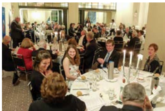
VIBE SAVOY WAS THE VENUE