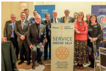
THE INCOMING BOARD