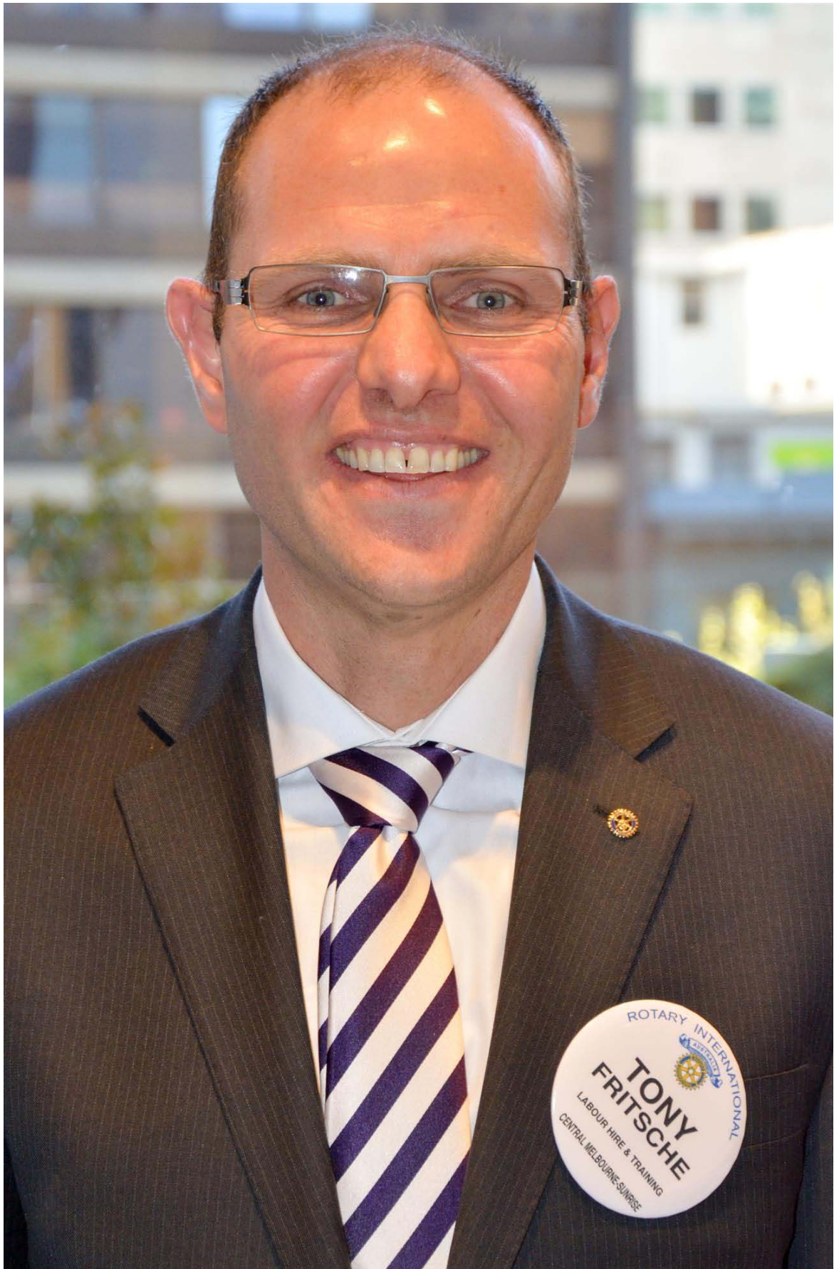
GUEST SPEAKER TUESDAY 30th SEPTEMBER