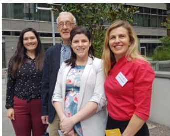
Our Be Collective Team