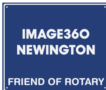
Lettering Only Version