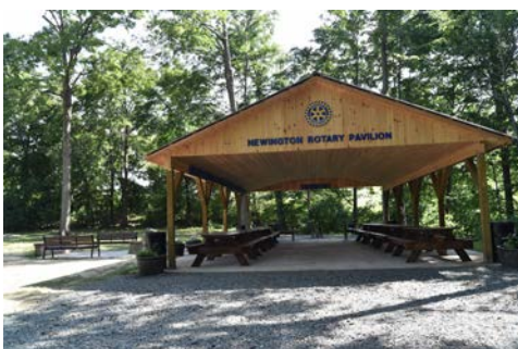
Can reserve the pavilion at the Newington Parks & Recreation office in Town Hall!