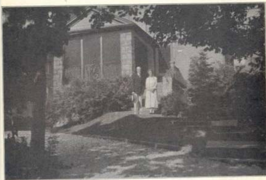
Paul and his Scotch lassie, Jean, at "Comely Bank" their home on the top of the wooded hill.

home in the country. He fears that her sense of duty may prompt her to disregard her own safety. Jean is essentially a home girl, a lover of good books and of the wholesome things of life. She and Paul spend their evenings, as a rule, in "Comely Bank," reading together. When it is Paul's turn to read, Jean's busy fingers fashion garments for the fatherless babes that are born at Cook County hospital. She has made hundreds of such garments during the course of years. Had Jean been a different type, Paul's course could not have been as it was. In her way she has made material though inconspicuous contribution to the cause of Rotary.