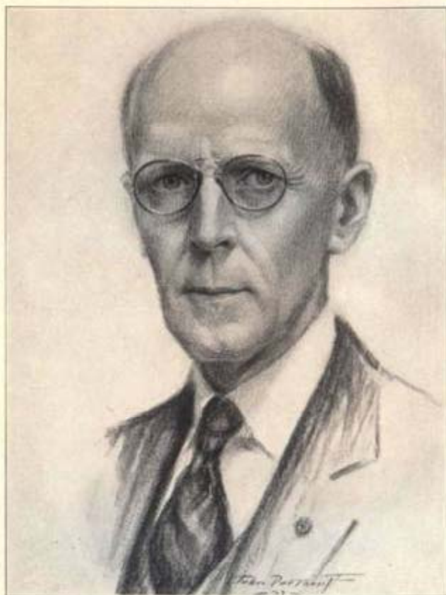
PAUL P. HARRIS