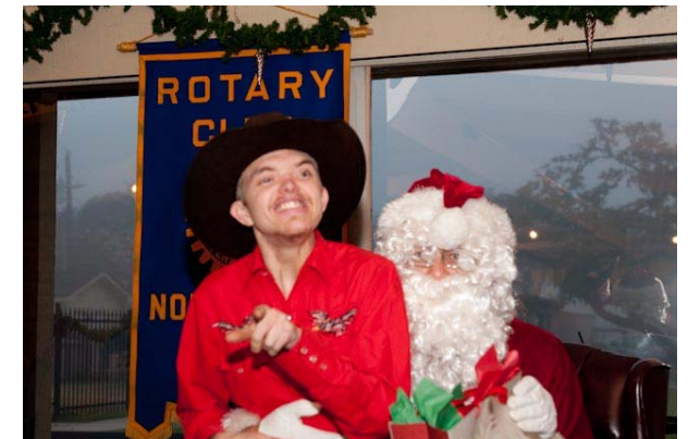
Santa came early on Dec. 9 th and delivered gifts to the wonderful clients of Bluebonnet MHMR Center at our annual breakfast party for the center.