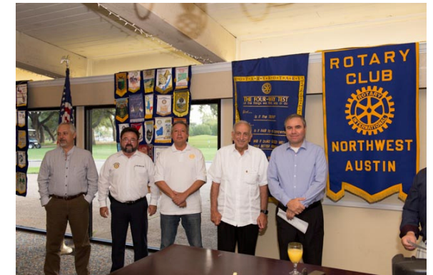
Five members of our sister club from Monterrey Obispado visited with us last week, discussing joint projects through district grants.