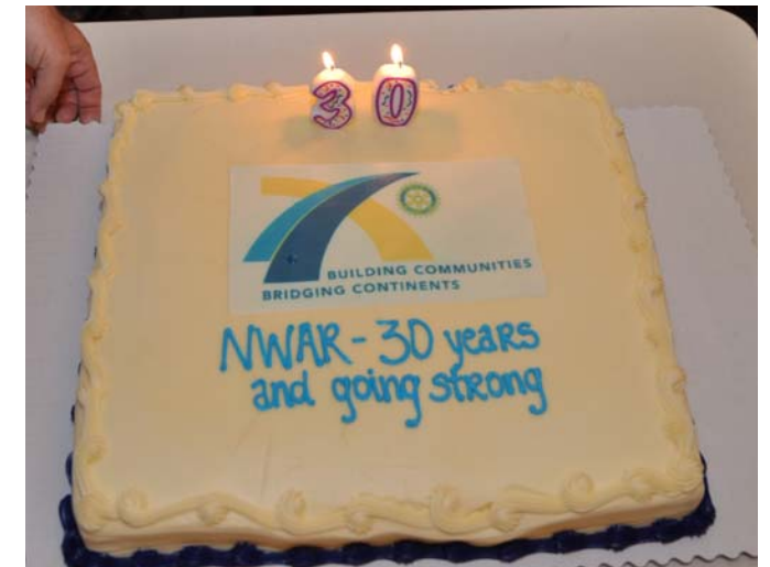
At last week's meeting, we celebrated our club's 30 th Anniversary with a breakfast cake!