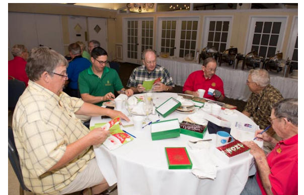
At a recent meeting, we signed Christmas cards for the troops. This has been an annual tradition for many years at NW Austin Rotary.