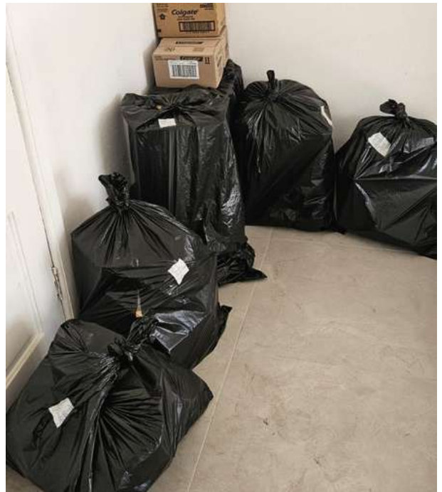
Oral care items to be repacked for distribution.