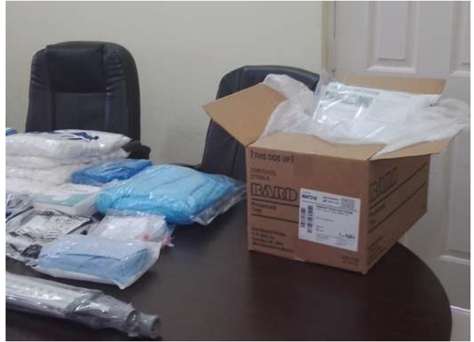
Medical supplies donated to Dennerly Hospital