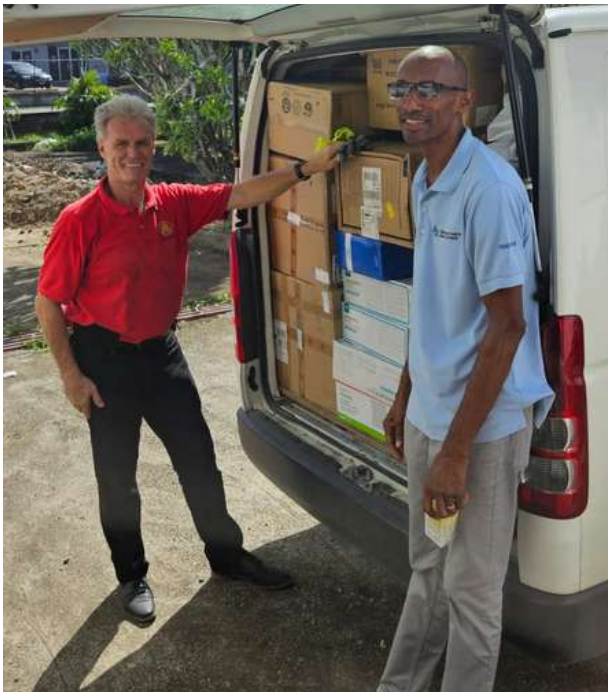
Medical supplies delivered to Millennium Heights Medical Complex