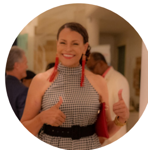
Sergeant at Arms