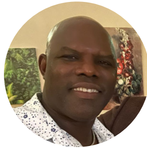
Immediate Past President