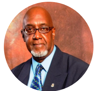
Elderly Care/After Meeting