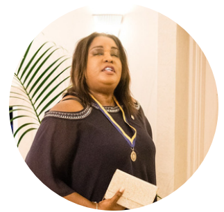
Vice President/Club Admin