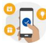
1. Choose your occasion