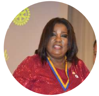
Vice President/Club Admin