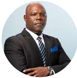
Immediate Past President