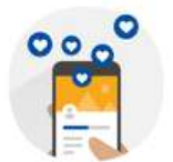
3. Inspire your community