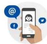
2. Choose what you want to support