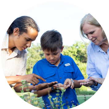
Supporting the Environment