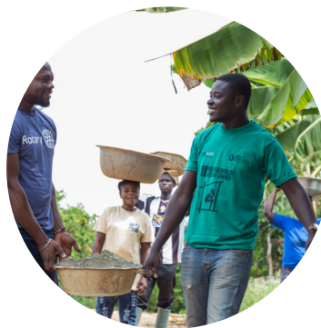
Providing Clean Water