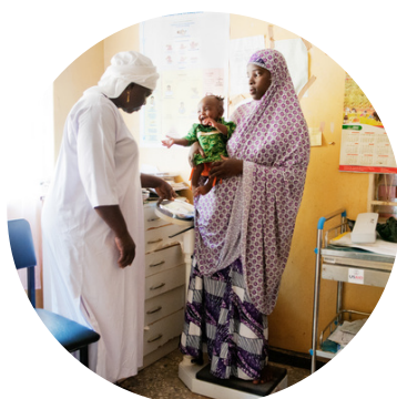
Saving Mothers & Children