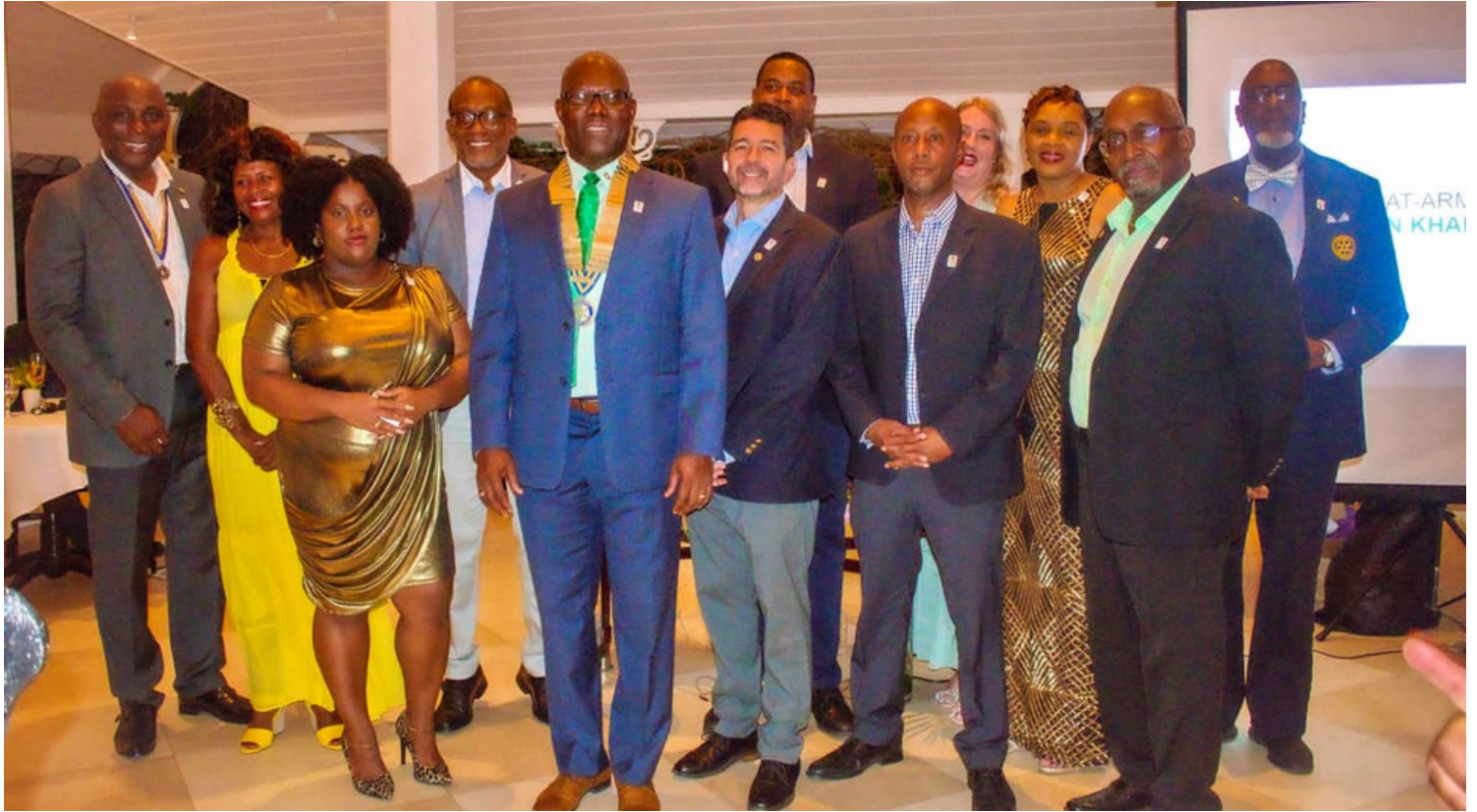
The 2022/23 Rotary Club of St Lucia Board All Freshly Pinned