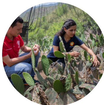
Growing Local Economies