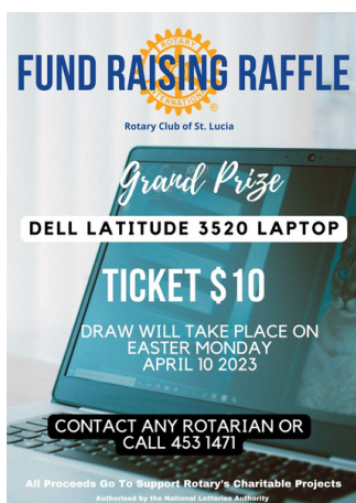
PP Frank organized a successful fundraising raffle of a laptop.