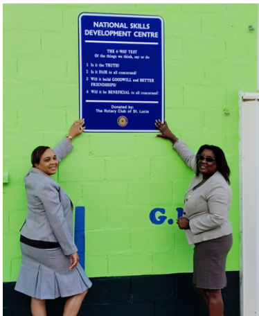
The vocational committee put up the Rotary 4 Way Test sign at the NSDC in Bisee.