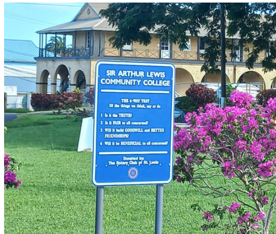
A new 4-way test sign was erected at the Sir Arthur Lewis Community College.