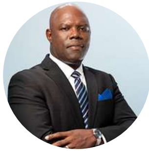
Immediate Past President