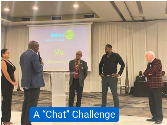
A "Chat" Challenge