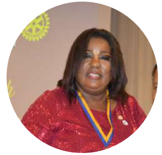
Vice President/Club Admin